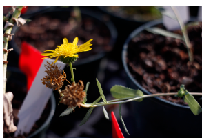
Figure 3. G. camporum flowering in the SJSU Greenhouse

G. camporum is under cultivation in SJSU's Greenhouse on the 7 th floor of Duncan Hall. Aerial portions of the plant are picked and dissolved in methanol to yield a crude extract. This crude extract was then