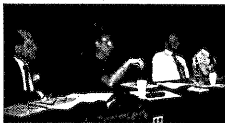
Packaging Advisory Board Members meet in council chambers

During the Spring Semester, the Packaging Student Association was very productive. They had several excellent guest speakers who shared their work experience at the Club Meetings. Club members attended the joint Western Packaging Association (WPA) and Institute of Packaging Professionals (IOPP) Golf Tournament (to raise funds), and hosted the Annual IOPP Student Night.