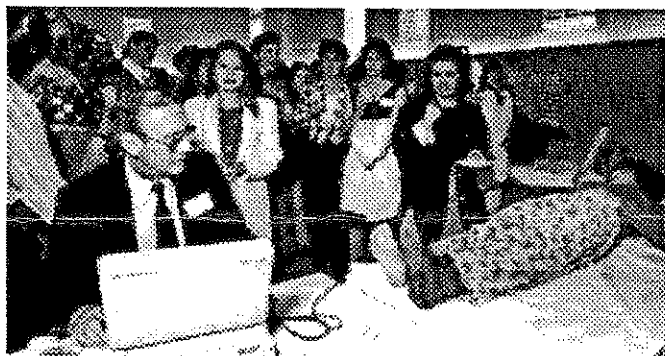
Bio-electrical Impedance Analysis demonstration at Circle of Friends Reception

The Circle of Friends maintains an on-going commitment to open doors to the future--join now! An application is provided in the newsletter (see page 7).