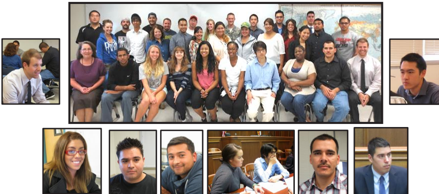
RCP: Changing lives, one petition at a time

The SJSU Record Clearance Project salutes all Justice Studies graduates for their hard work and dedication to promoting justice!