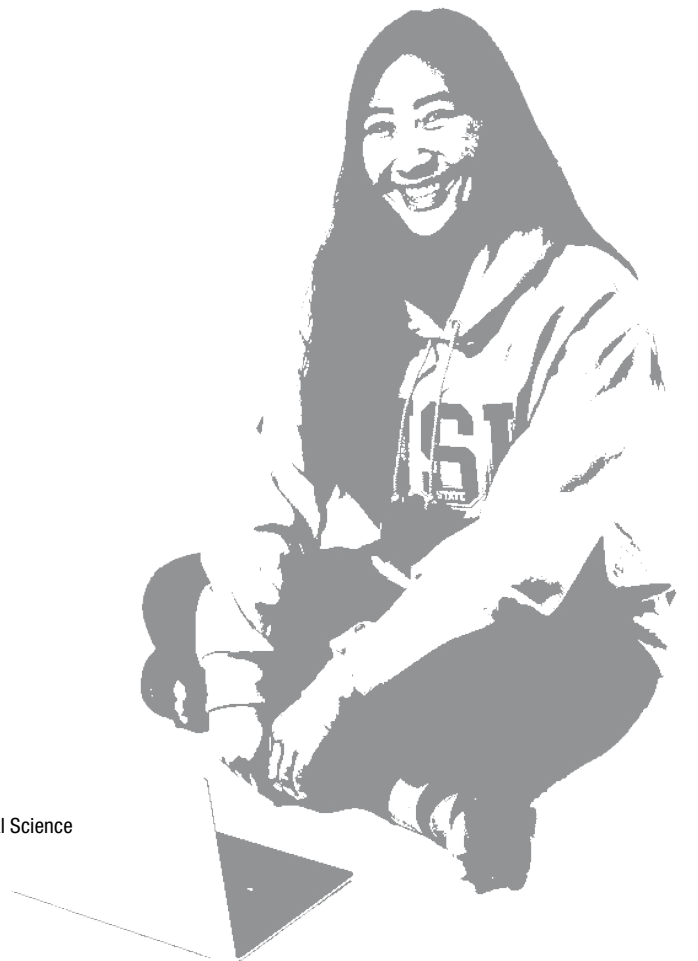
Ling BA Behavioral Science

If you anticipate any problems completing the required steps below by the stated deadlines, contact nextsteps@sjsu.edu immediately.