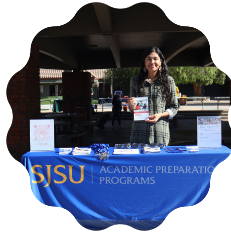
UCSC Cal-SOAP Higher Ed Week Tabling Event at Yerba Buena High School

EAP is happy to present to families, guardians, and parents!